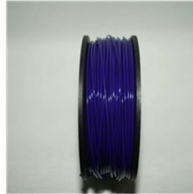
蓝色线材 PLA-1(硬) 100元