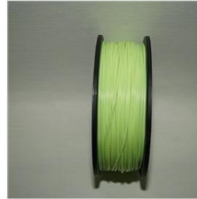
黄色线材 PLA-1(硬) 100元