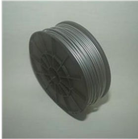
银色线材 PLA-1(硬) 120元 1卷