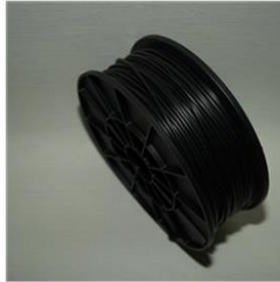
黑色线材 PLA-1(硬) 100元